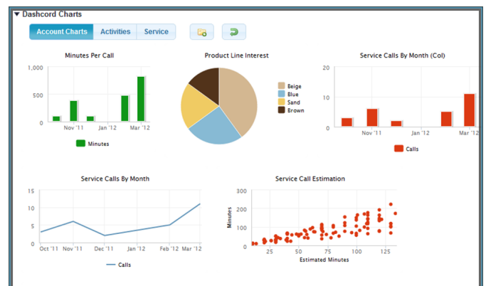
Easily customizable chart library